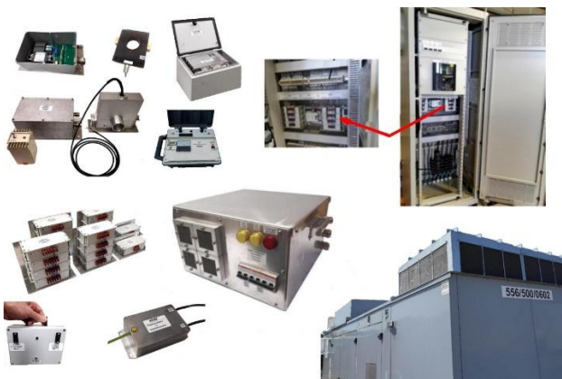
Fig. 5. EMP protective means developed by author: power transformer protection, power main DC simulator, protection of control cabinets with electronic digital equipment, special EMP filters for civil equipment, automatic reserve EMP protected battery charger for electrical substations, Ethernet telecommunication protective module, and even protective means for high power backup diesel generators.

In accordance with the specific strategy for the protection of civilian infrastructure previously proposed by the author, he also developed specific means of protection, which are installed in trial operation and have already been tested in several electrical substations during 2 – 3 years, Fig. 5.