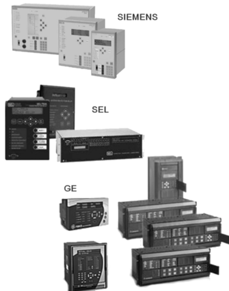
Fig. 1 – Configuration of Modern MPDs of Different Brands.

Usually separate MPDs are installed in relay cabinets: 3 – 5 units in each cabinet, Fig. 2.