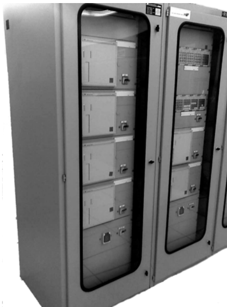
Fig. 2 – Method of MPD Installation into Cabinets in Use Today.

Historically, [5] there are a large number of non-interchangeable and incompatible MPD designs. This means that if a certain module of any MPD installed in the particular substation or power station fails, it can be replaced only by the same component, produced by the same manufacturer. Thus, after spending a small fortune purchasing an MPD from a specific manufacturer, one falls into economic dependence on this manufacturer for the next 10–15 years, since after having chosen one manufacturer it no longer makes any difference if there are other manufacturers in the market, as one cannot use their products. And the only way to get out of this is to pay a small fortune one more time for the MPD from another manufacturer (and, thus, switching from one bondage to another). And what does the manufacturer do with an absolute monopoly? Right: the manufacturer increases the price! The price of one spare MPD module can reach almost one-third or even a half of that of the entire MPD! As